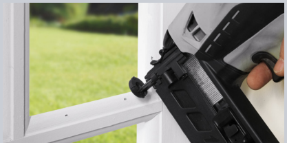
Second Fix Applications